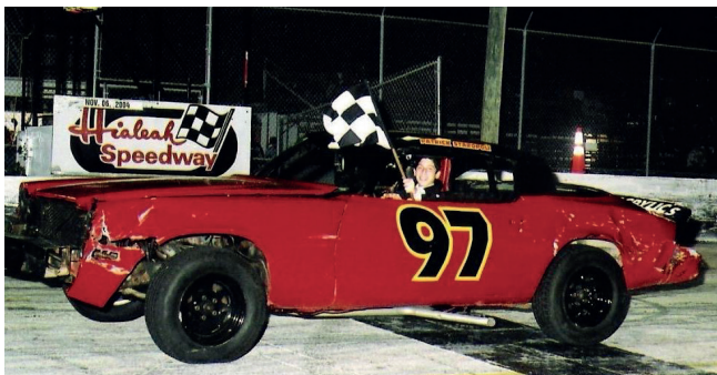
(Above) First win in a stock car (Pure Stock division) at Hialeah Speedway in Hialeah, Florida (Patrick's home track). November 2004.