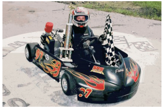
First ever win in a go-kart in Naples, Florida.