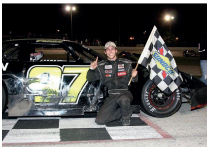
(Left) Win in the Super Late Model division at Auburn Dale Speedway, Auburn Dale Florida. March 2012.

exit on a corner, you don't want to hurt the entry or the centre part. It's the same in medicine, you make a differential and you pick the treatment that helps someone the most with the least amount of side-effects." He believes that being a racing car driver has made him a better clinician and vice versa.