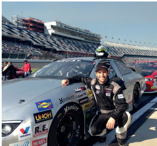
Pre-race photo from the NASCAR ARCA Series at Daytona International Speedway. February 2015.