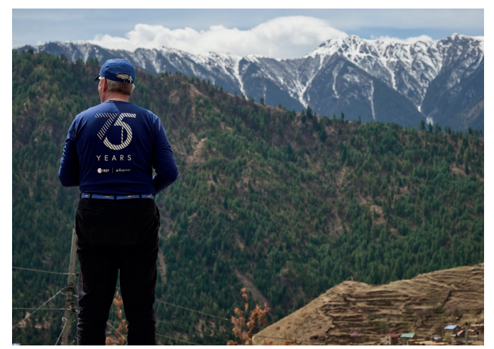
Planning our 'As Far as the Eye Can See' Challenge Events programme.