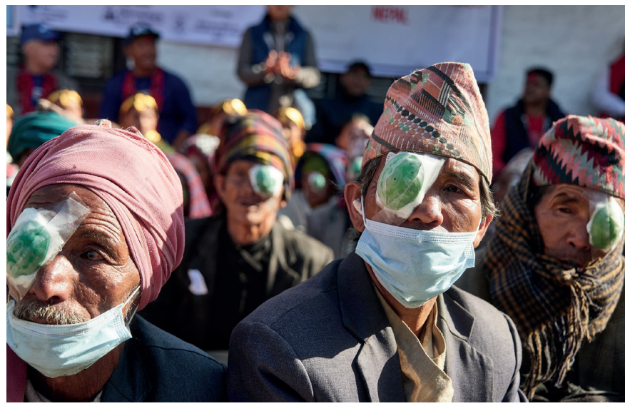
Post-op patients at our Jumla Camp.